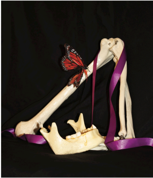
Still Life Set Up Example