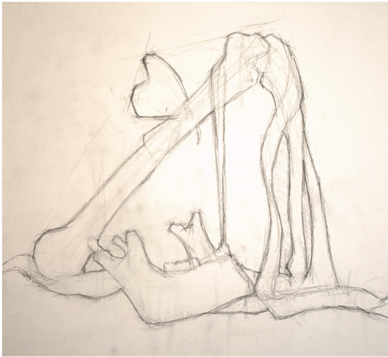
Stage 1. Graphite Underdrawing