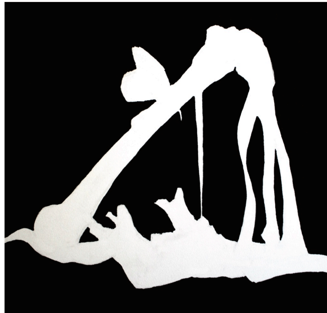
Stage 3. Fill in the negative space with a black marker (Markers used in demo: fine point black sharpie, and a "Chisel Tip" Black Sharpie)