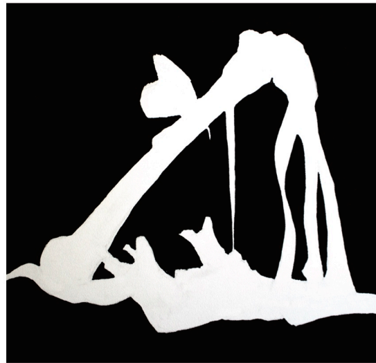
Finished Positive / Negative Space Project (with sharpie)