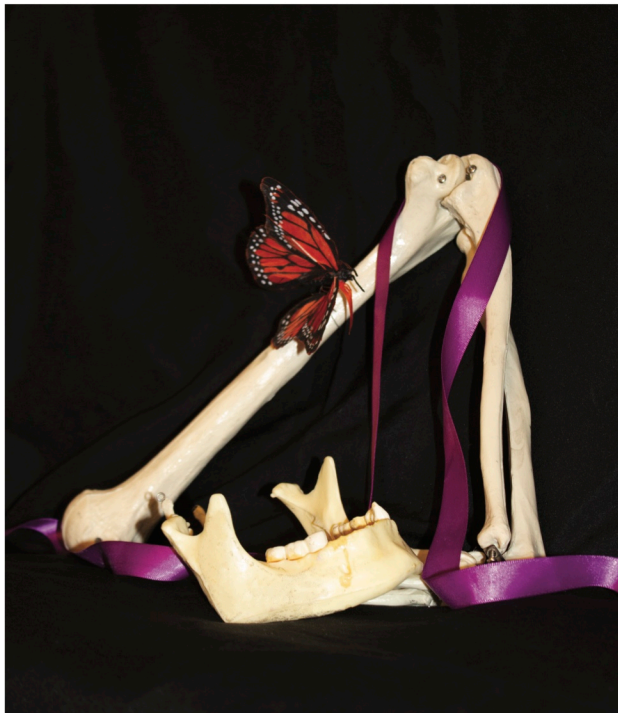
Still Life Set Up Example