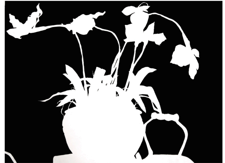
Positive / Negative Space Project Example